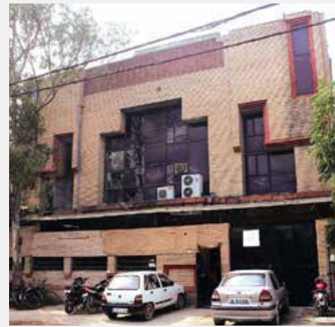
C-62/2, OKHLA PHASE-II