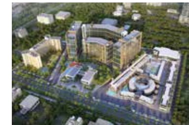
KNOWLEDGE PARK V, GREATER NOIDA WEST