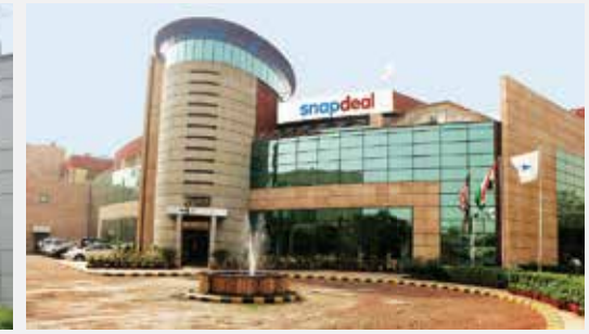
A-28, MATHURA ROAD