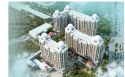
SECTOR 37 C, GURGAON-DWARKA EXPRESSWAY