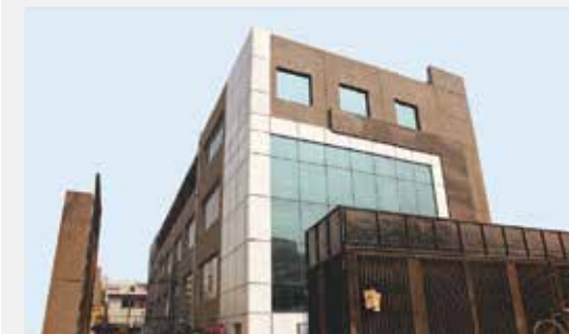
B-61, OKHLA PHASE-I