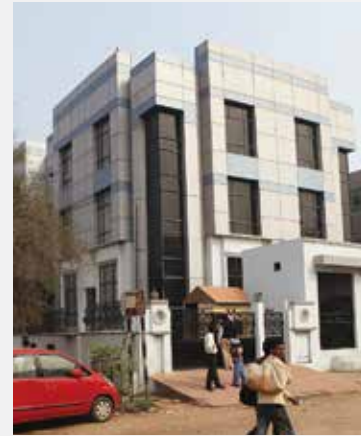
B-60, OKHLA PHASE-I