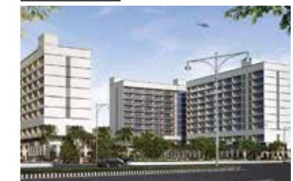
SECTOR 37 C, GURGAON-DWARKA EXPRESSWAY