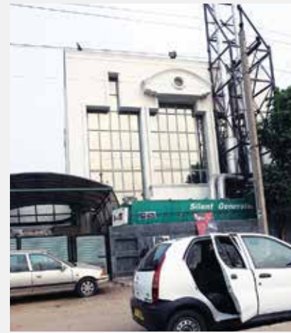
D-184, OKHLA PHASE-I