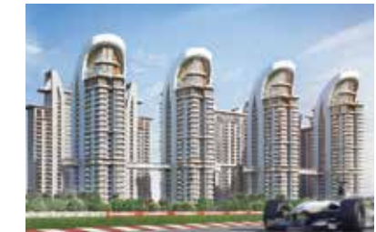
JAYPEE SPORTS CITY, YAMUNA EXPRESSWAY, GREATER NOIDA