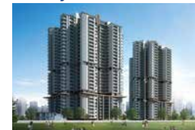
JAYPEE SPORTS CITY, YAMUNA EXPRESSWAY, GREATER NOIDA