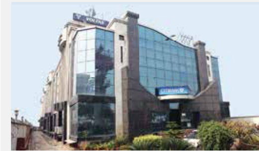
A-43, MATHURA ROAD