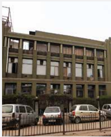
B-235, OKHLA PHASE-I