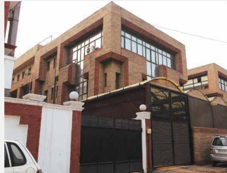
F-23/1, OKHLA PHASE-II