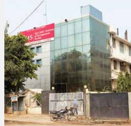
B-64, OKHLA PHASE-I