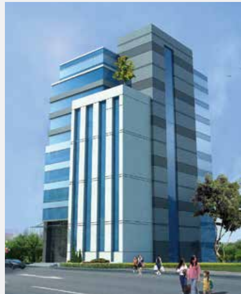
PLOT No. 7, SECTOR 125 NOIDA