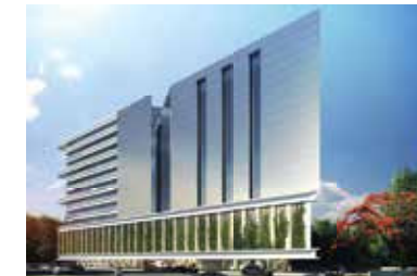
SECTOR 62, GOLF COURSE EXTENSION ROAD, GURGAON