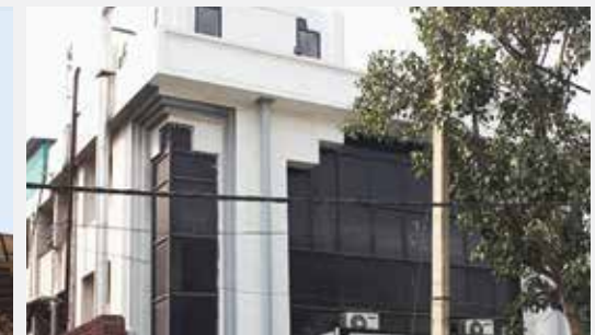
D-1/3, OKHLA PHASE-II