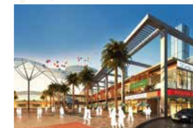
KNOWLEDGE PARK V, GREATER NOIDA WEST