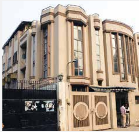
A-1/1, OKHLA PHASE-I