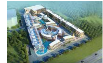
KNOWLEDGE PARK V, GREATER NOIDA WEST