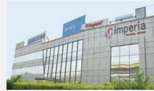
A-25, MATHURA ROAD